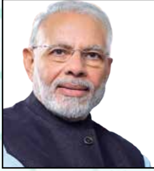
Shri Narendra Modi Hon'ble Prime Minister of India

“ASPIRE, a scheme for promotion of innovation rural industries and entrepreneurship launched by the Prime Minister aims to develop 75,000 skilled entrepreneurs in agro-rural industries with 80 livelihood business incubators and 20 technology business incubators”