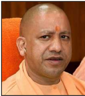
Shri Yogi Adityanath Hon'ble Chief Minister of Uttar Pradesh