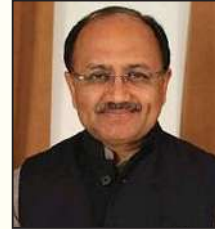
Shri Sidharth Nath Singh Hon'ble Cabinet Minister, MSME & Export Promotion, Govt. of UP